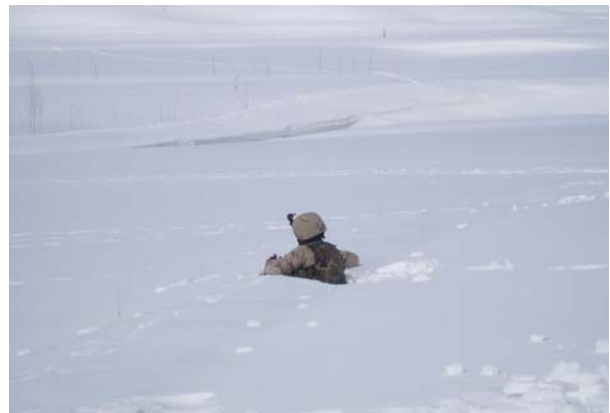
6ft 2in Soldier checking the snow depth