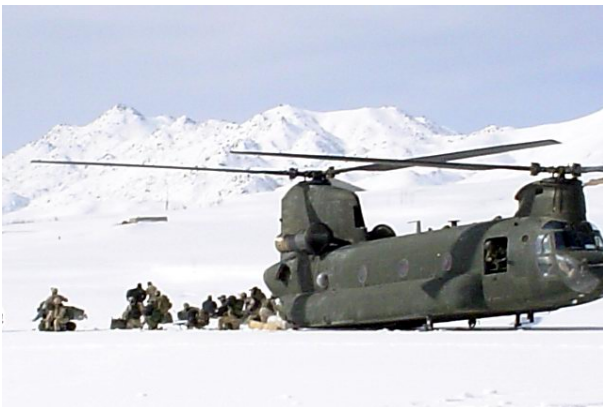
Initial CH-47 Off-load in Bahguchar